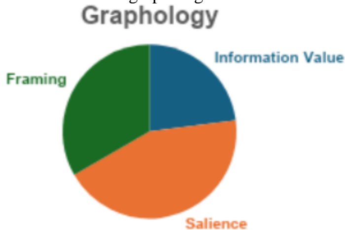
Figure (1): The distribution of graphological resources in the SFA .