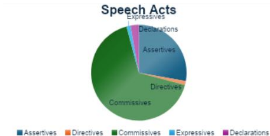
Figure (4): The distribution of the different categories of speech acts in the SFA.