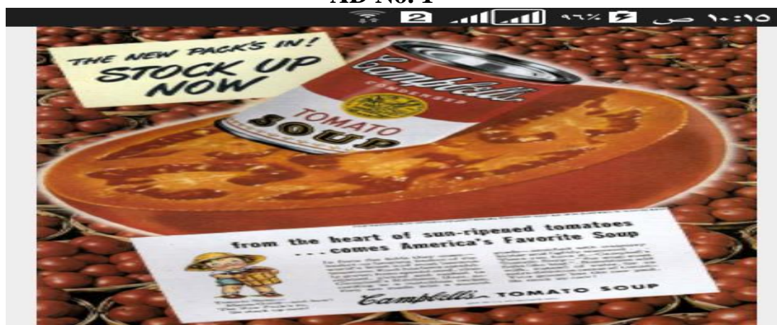
Art Crimes Advertising, Propaganda, and Graffiti Art